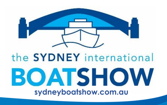
EXHIBIT IN THE U.S.A. PAVILION AT THE SYDNEY INTERNATIONAL BOAT SHOW

International Convention Centre and Cockle Bay Marina Darling Harbour, Sydney