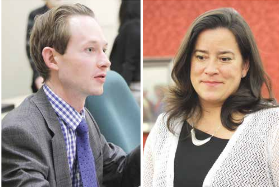
Conservative MP Michael Cooper, left, is calling on Justice Minister Jody Wilson-Raybould, right, to make progress on Bill C-39 to remove zombie laws from the Criminal Code, after more than a year of inaction.

Defence lawyers immediately launched an appeal and sought a mistrial on the grounds that the judge had applied Section 230