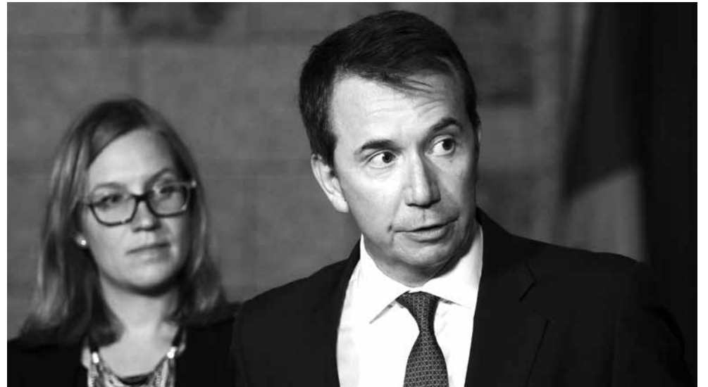
New rules to 'strengthen' laws around third-party election activity are coming, says the office of Democratic Institutions Minister Karina Gould, left, pictured in June 2017. Treasury Board President Scott Brison is filling in for Ms. Gould while she is on maternity leave.

Last week, the Public Policy Forum think-tank released a report commissioned by Elections Canada with eight recommendations for modernizing the country's political financing system. It focused on levelling the playing field for all participants in elections—candidates, parties, riding associations, and registered third parties—and echoed Sen. Frum's call to