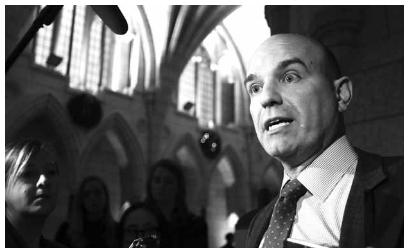
NDP MP Nathan Cullen says his party welcomes rules around election spending, but if they're rooted in facts backed by federal departments.