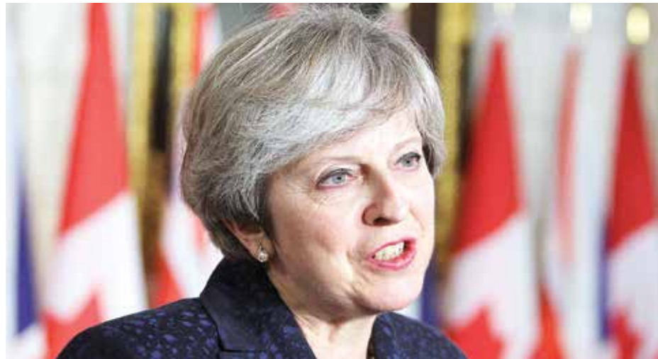
U.K. Prime Minister Theresa May, speaking in the House of Commons foyer during a September 2017 visit to Canada, faces backlash from Brexit hardliners in her divided caucus if she doesn't commit to a strong break from the EU.

With negotiations entering an intense phase, it's hoped a series