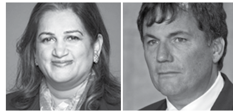
Liberal MP Salma Zahid, left, and Fisheries Minister Dominic LeBlanc are undergoing treatments for their cancer. Spokespeople have indicated they are both doing well.