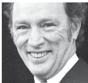
The Oxford Dictionaries has added more than 30 new words including Trudeauania and fuddle duddle, which was first used by former prime minister Pierre Elliot Trudeau to mask a swear word.