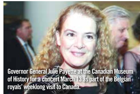
Governor General Julie Payette at the Canadian Museum of History for a concert March 13 as part of the Belgian royals' weeklong visit to Canada.