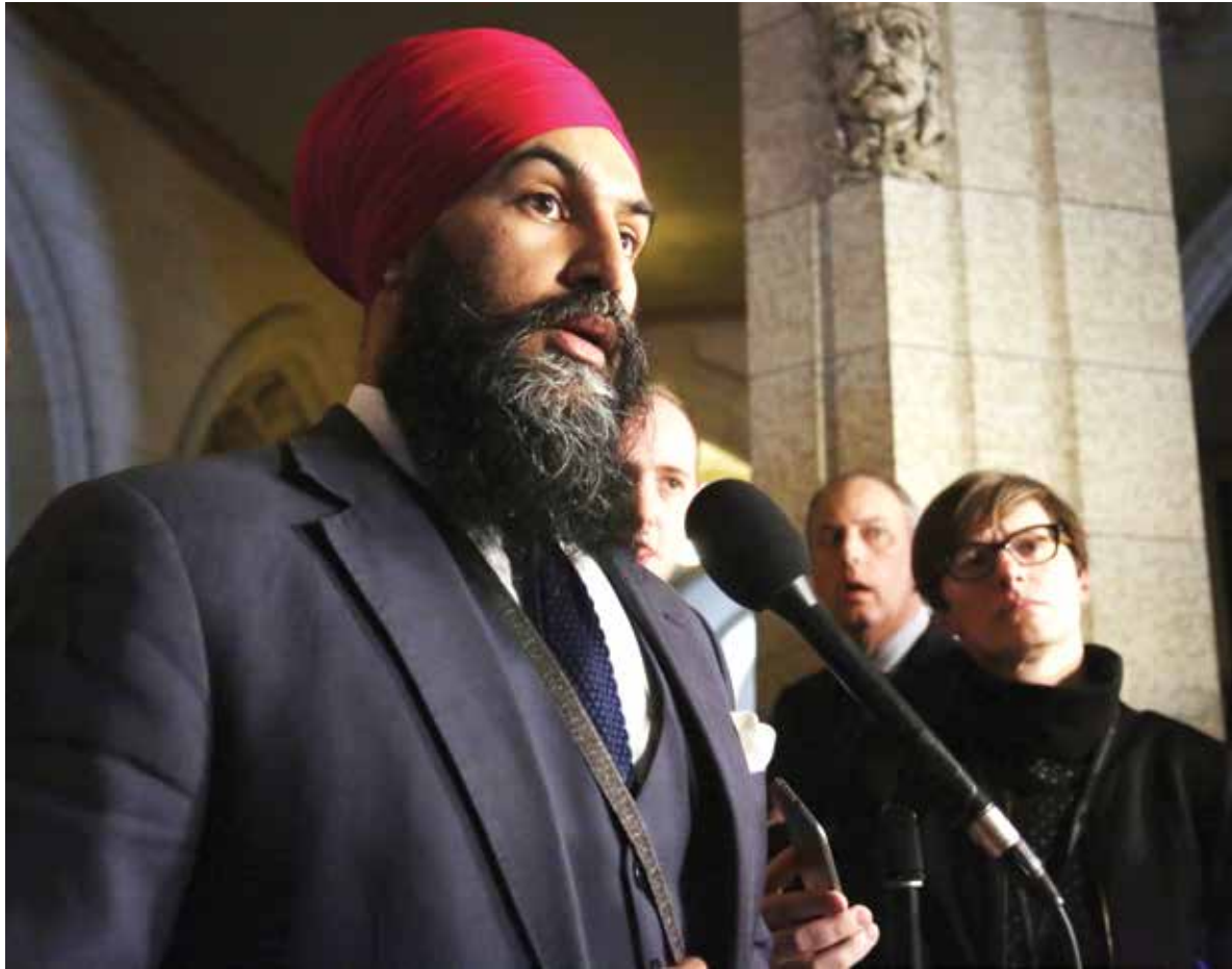
NDP leader Jagmeet Singh has been under fire for his associations with people or groups who support Sikh nationalism and separatism, including some who condone the use of violence. Mr. Singh has said he condemns violence to achieve political objectives.

NDP MP Kennedy Stewart (Burnaby South, B.C.), who sup-