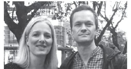
Environment Minister Catherine McKenna hanging out with American Actor Neil Patrick Harris.

Environment Minister Catherine McKenna bumped into U.S. actor Neil Patrick Harris , and yes, he looks exactly like Veterans Affairs Minister Seamus O'Regan .